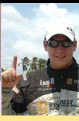
Benito Guerra Latapi (is this the kid from WCBF 1994 group from Mexico?) Current Mexico Rally driver Champ.